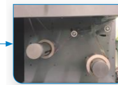
Dual-Rewinding system separate jobs with ease