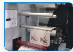
Lamination & Lamination liner removal