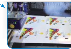
Laser system Full/kiss cut, perforations and marking can be cut in a single pass! 80 or 150 watt options available!