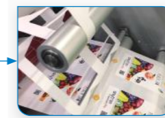
Matrix removal & Slitter In-line slitting with up to 7 knives available